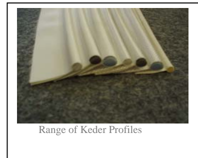
Range of Keder Profiles

Station Road ,Thirsk North Yorkshire, YO7 1PZ