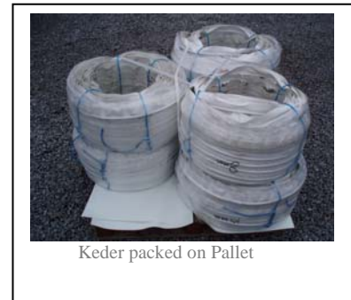
Keder packed on Pallet

Our keder product is manufactured from a solid PVC core wrapped using quality reinforced PVC coated fabric and is available in a number of different sizes.